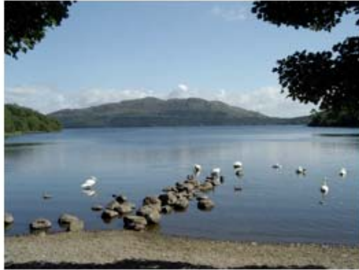
The Lake Isle of Innisfree

I WILL arise and go now, and go to Innisfree, And a small cabin build there, of clay and wattles made; Nine bean rows will I have there, a hive for the honey bee, And live alone in the bee-loud glade.